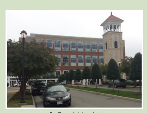
St. Francis Hospital