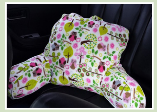
I bought this at ross for $13! It is so comfy!

So I ended up getting 400cc on the left (I think) and 425 on the right. He said I was a little uneven from my scoliosis I have. Soo happy I could fit the bigger cc's instead of 375 though! :)